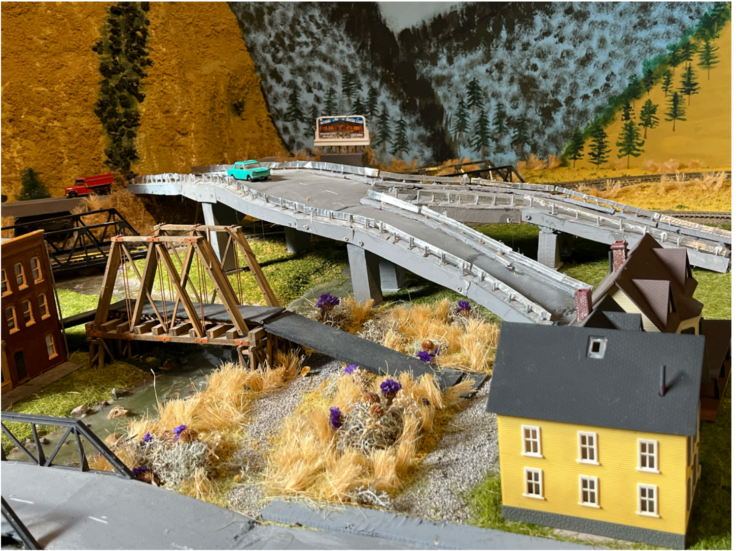
Hellgate canyon and Clark Fork River coming from the East. Madison bridge, native grasses and flowers in a foot path area, handmade foot bridge, and billboards announcing 1,631 miles to the National Music Camp at Interlochen (where I taught piano for 46 years!).