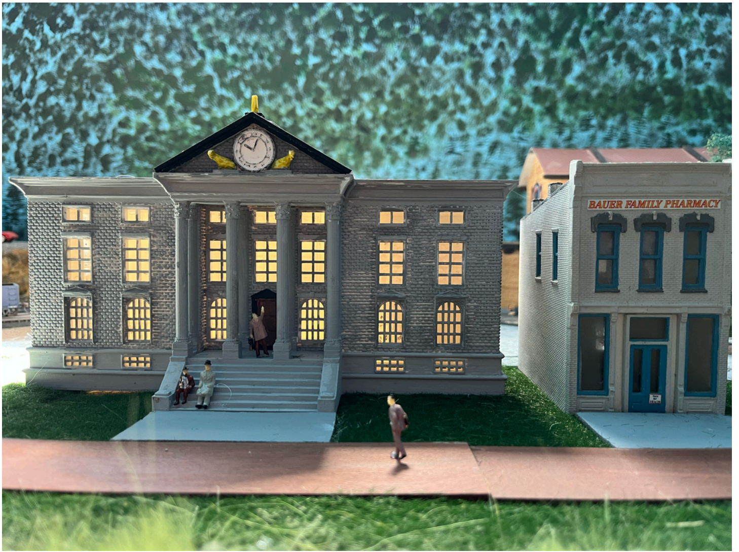
Courthouse where I received my driver license at age 14!