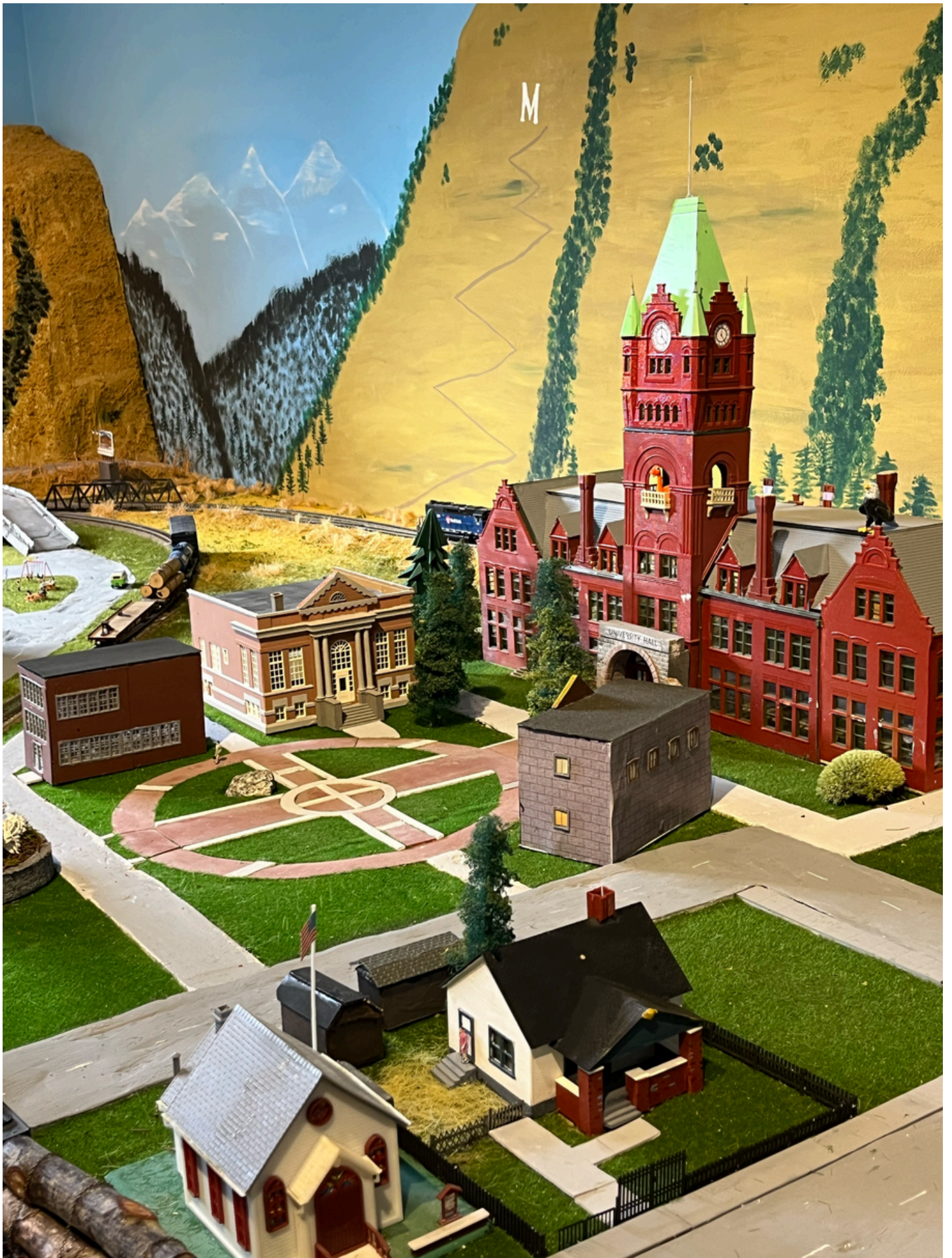
Other view of my teacher's home and university campus.