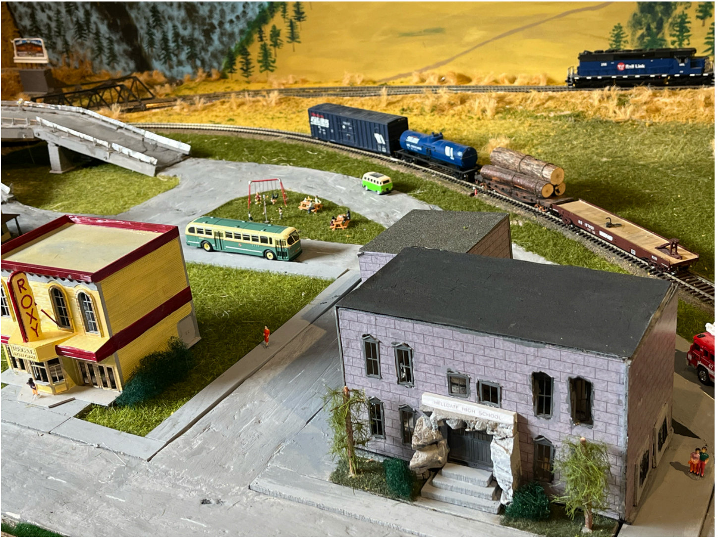
Hellgate High School, Roxy theater, and park.