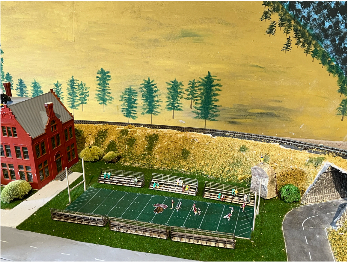
Home of the Montana Grizzlies football team. As teenagers, we used to watch games from Mt. Sentinel. The current stadium is no longer at this location.