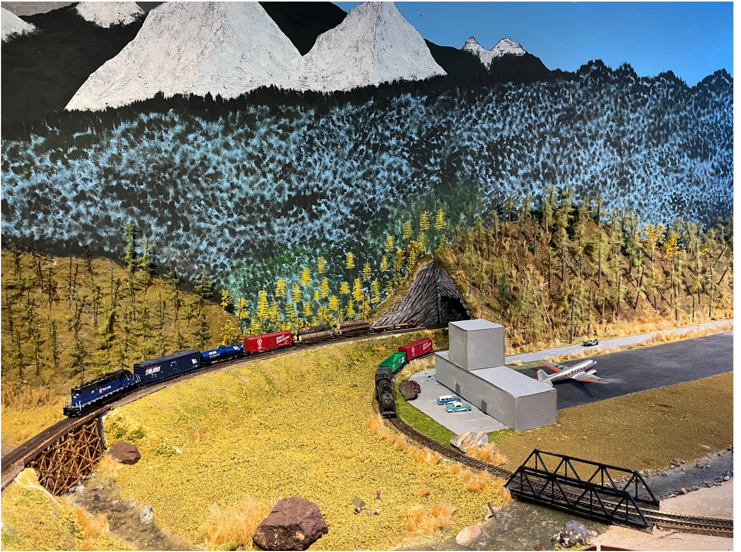
Double railroad tunnel (removable) and Smokejumpers school and HQ as it was in the 1960s with DC-3 airplane.