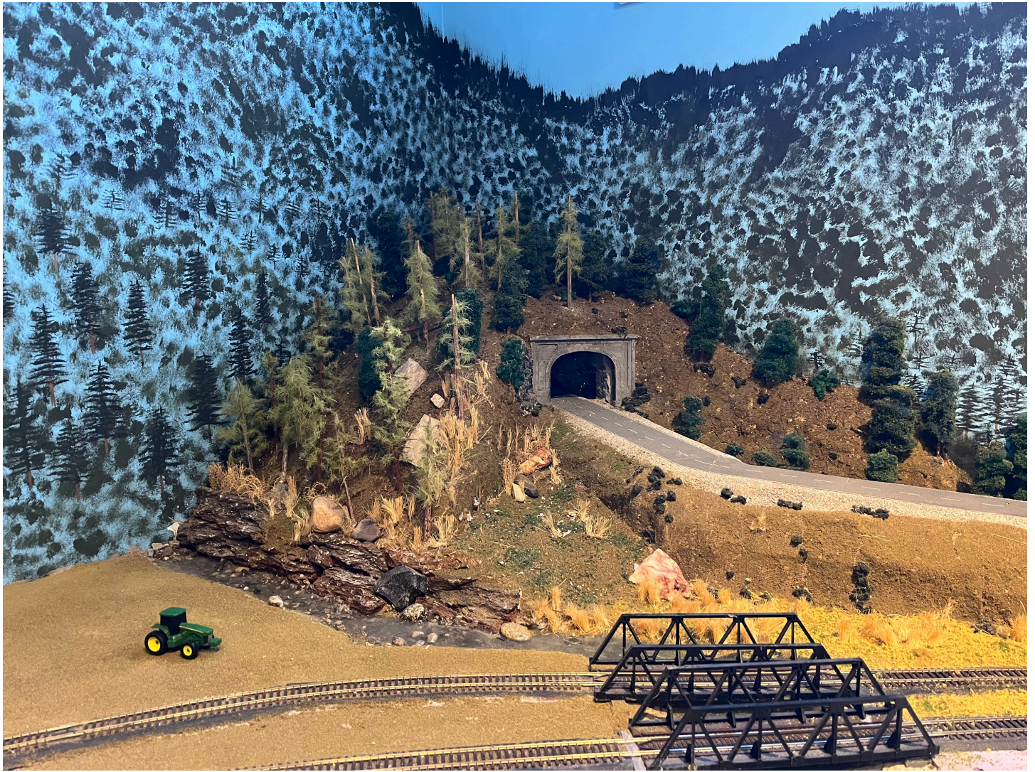
Northwest of Missoula, indicating direction of glacial lake Missoula as it flooded around Rocky Mountains. (The floods happened at least 40 times, meaning there are that many lake level lines observable on Mt. Sentinel to this day.