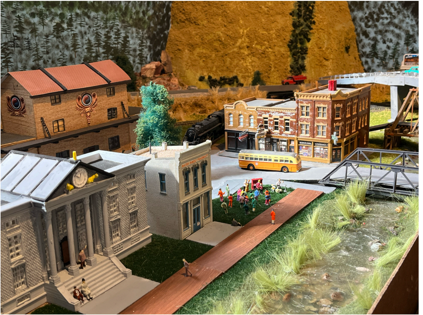
Clark Fork River, downtown, and train station.