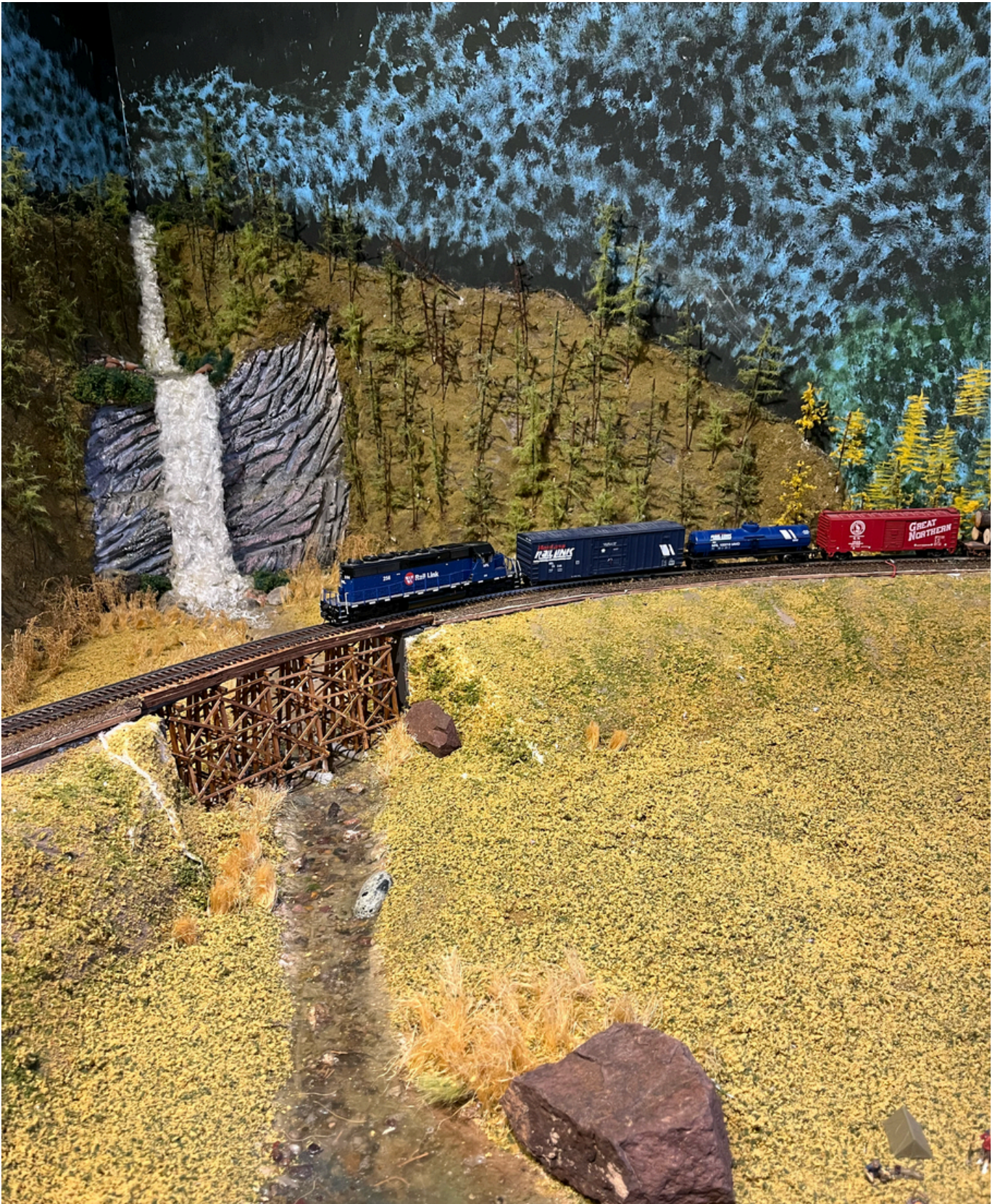
Bitterroot creek, then river as it descends from the southern wall of Lake Missoula. (River boulders are actually gravel that Missoula County Road Commission uses in winter for rural roads.)